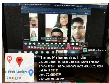
Participants of the session